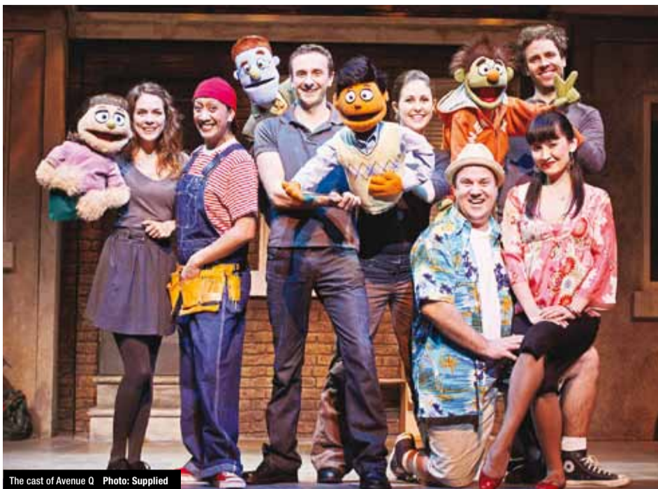
The cast of Avenue Q.