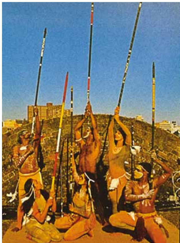
The Birth of Bangarra (posters for sale: www.blackfellasdreaming.com.au)